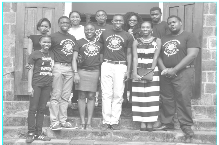
A representative contingent of MADE St. Kitts members

(MADE Founder and President [MADE St. Kitts])