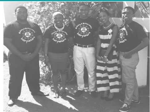
M.A.D.E. St. Kitts Executive Team.