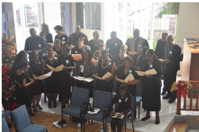
Tribute by the Members of the Joint Board