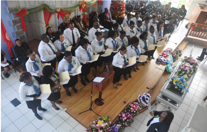
Tribute by the Eastern Caribbean Central Bank