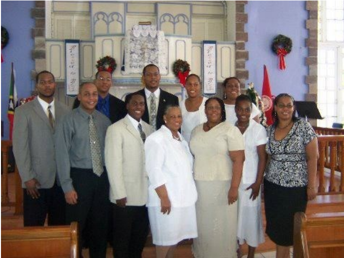
The Christmas Family