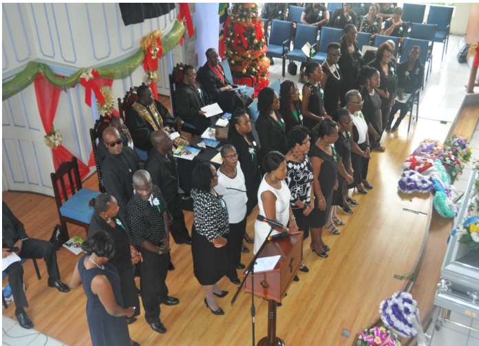
Tribute by the Zion Gospel Singers