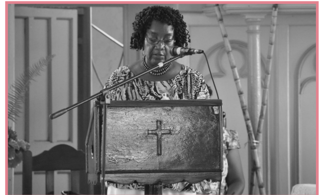
Zion Senior Club worshipping at Zion Moravian Church (25 October 2015)