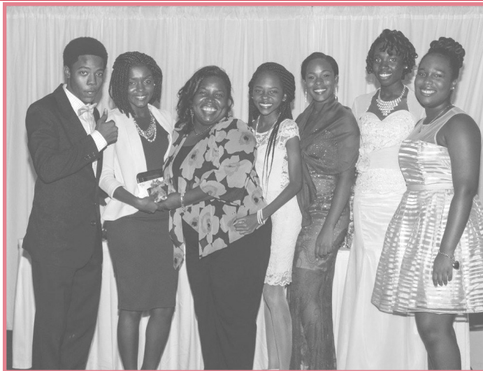
Outstanding Youths for 2015 with Advisor of the Year