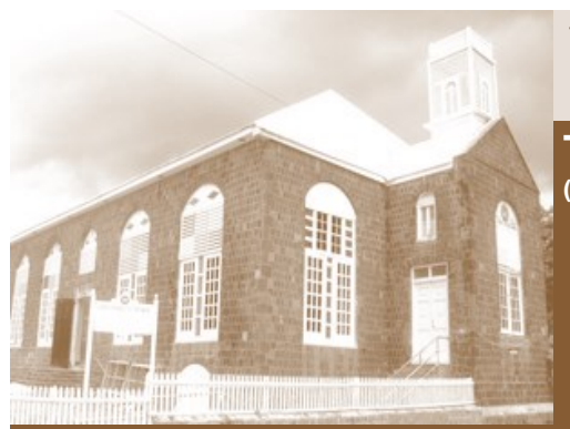
THE ZION MORAVIAN CHURCH

(Established 1777) 238 Years of Christian Witness