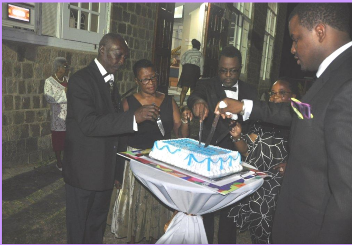
Staff Members Cutting Church Birthday Cake - Black Tie Affair

The Moravian Church worldwide (Unitas Fratrum) celebrated 559 years of work and witness on 6 March 2016. In commemoration of the same, the St. Kitts Conference had one week of celebration from 29 February to 6 March 2016 under the theme Retelling our Story, Remembering our Struggles, and Recognizing our STRENGTH (God) .