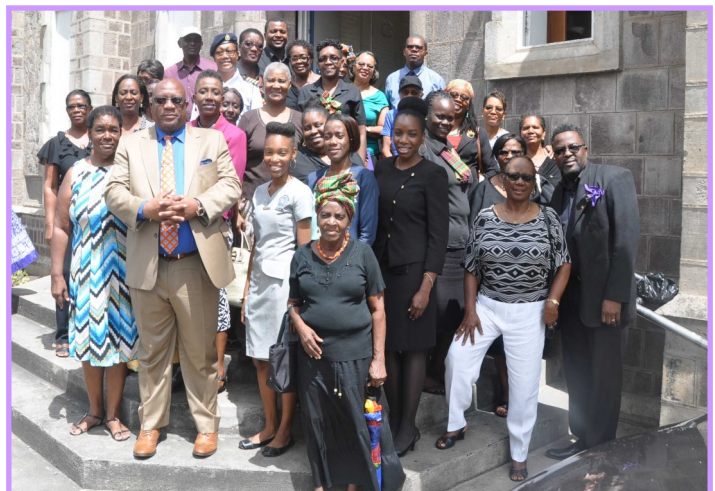
Mid Week Lenten Service at the Catholic Church

As Moravian Week is ended, may we continue to share the news that “Our Lamb has conquered; let us follow Him” and create our own history.