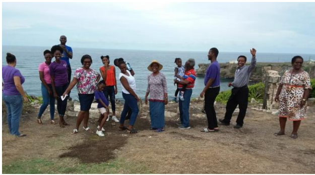
MEMBERS AT THE OUTDOOR WORSHIP BUS RIDE