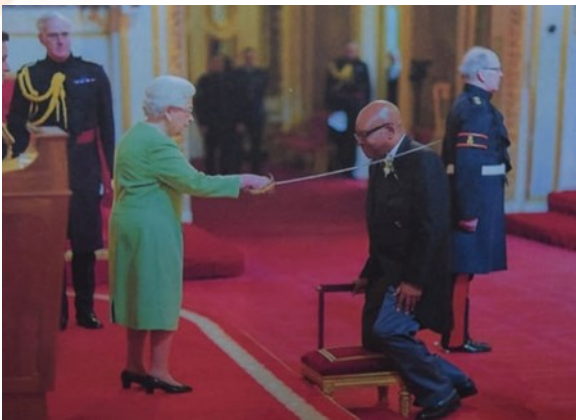
Sir Tapley being knighted by the late Queen Elizabeth II

Victorian Order, King's Counsel, Justice of the Peace, Doctor of Laws, Former Governor-General of St. Kitts and Nevis.