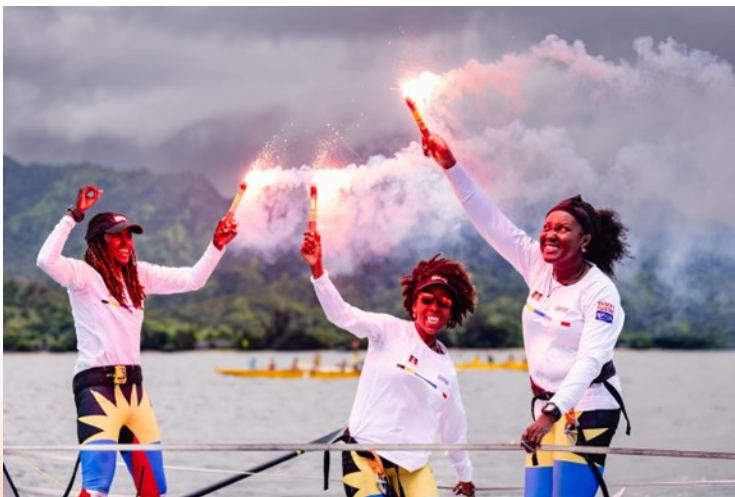
The joy of crossing the finish line - flares up!

Even though the entire journey required new levels of output to stay the course, their hardest segment was the last push to the end. The weather was against them, pushing them away from Hanalei, Kaua’i. They could see Kaua’i but the strong currents were pushing them away from the entry point. They recall rowing for hours but not moving forward. Words like “endless” and “useless” were used to describe that phase of the journey. These conditions caused the race supervisory team to suggest the possibility of the coast guard being instructed to tow their boat to shore. There was no way that this team would allow that to be their fate. It was then that all hands were summoned, and for the first time, all three were rowing to shore. They dug deep into their reserves to find both strength and faith and pushed to the end. There were points when it seemed like there was no strength, but they kept going and surprised the race supervisory team and themselves and came across the finish line.