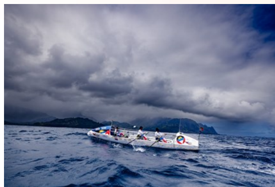
Island Girls on the Pacific - Cloudy