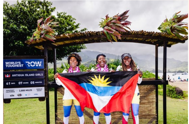
It is finished! Represent!