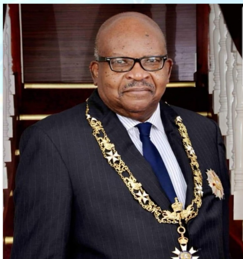
Sir. Tapley Seaton Governor General of St. Kitts & Nevis

The University of the West Indies (Open Campus) at its Graduation Ceremony in Antigua on 12 th October, 2019 honoured Governor-General of Saint Kitts and Nevis His Excellency Sir S. W. Tapley Seaton GCMG, CVO, QC, JP with the Honourary Degree of Doctor of Laws (LL. D.) in recognition of his Public Service.