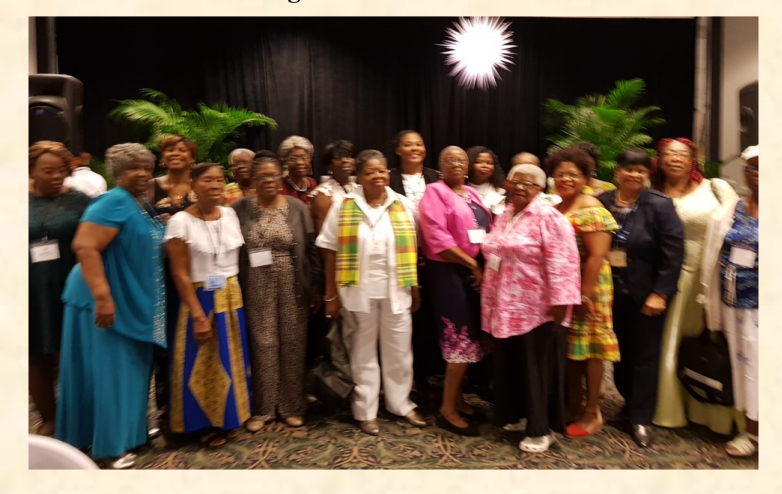
Virgin Islands delegation to the women's conference.

A total of 67 women from the Eastern West Indies Province attended the Moravian International Women's Conference. Continue on Page 6