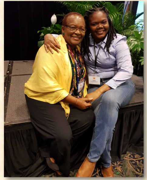
Kitts delegation to the women's conference