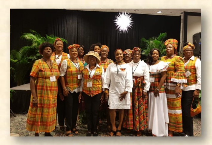
Antigua delegation to the women's conference