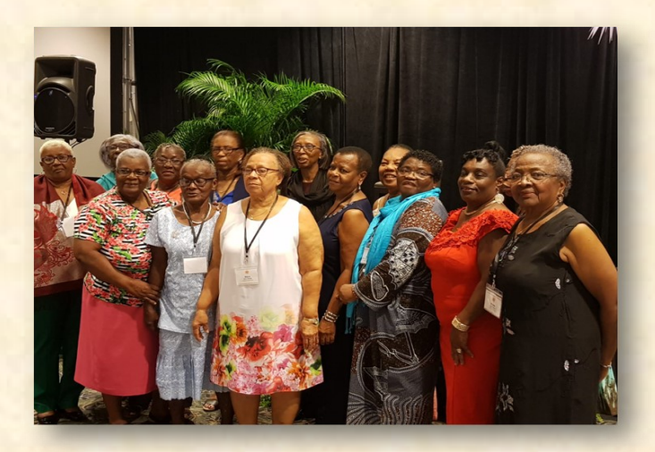
Barbados delegation for the women's conference