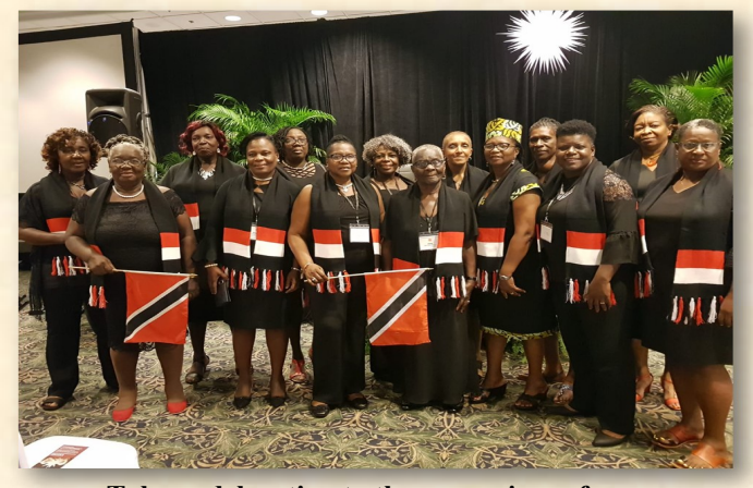
Tobago delegation to the women's conference