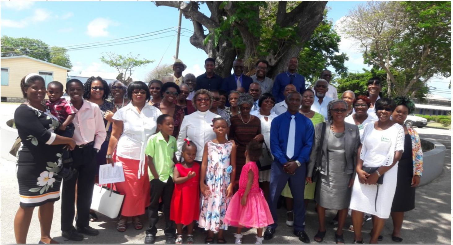
Congregation at Faith Barbados on April 8th.

"Advance the Kingdom" - Live as Kingdom Citizens