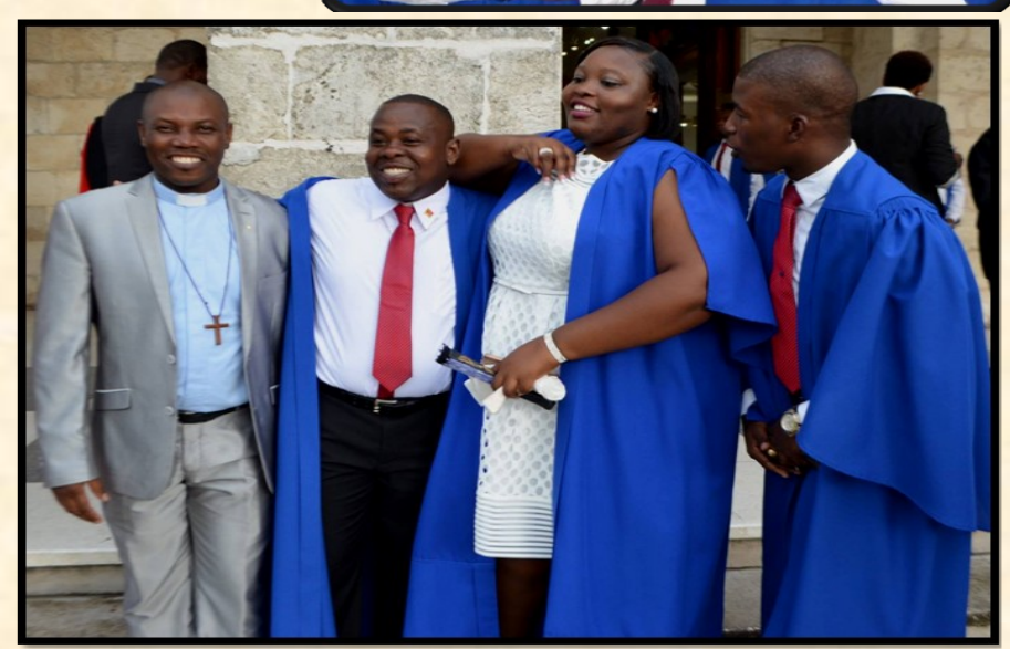
'Advance the Kingdom' -Use the Keys