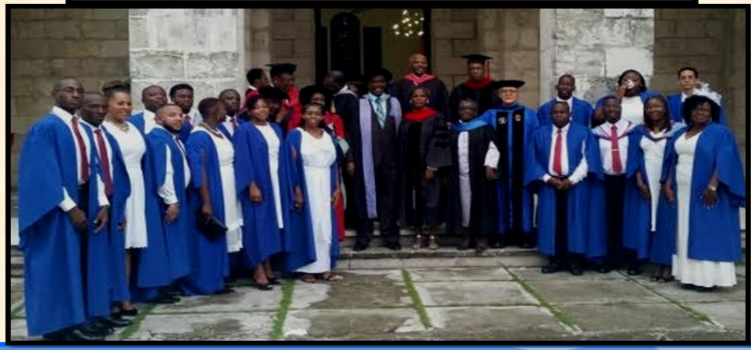
'Advance the Kingdom' -Use the Keys