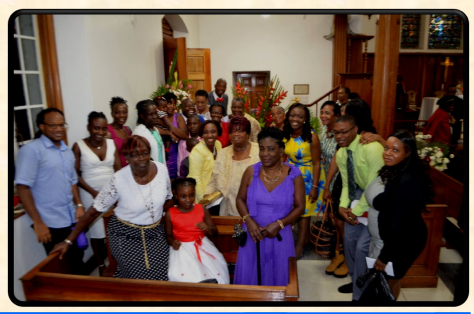
'Advance the Kingdom' -Use the Keys