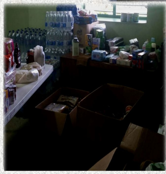
Fulfilling the Mandate - Advance the Kingdom