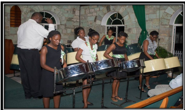
Gracehill Moravian Steel Orchestra