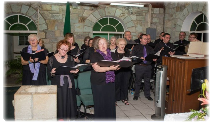
Central Moravian Church Choir