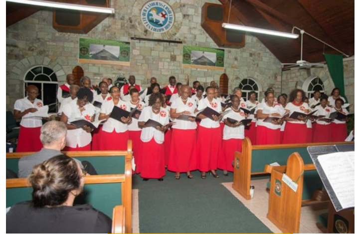
Moravian Mass Choir