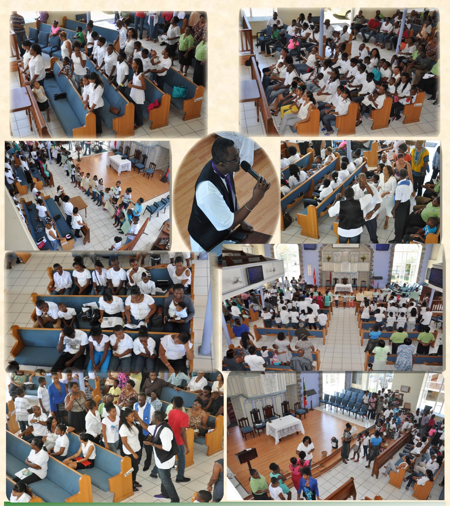
Fulfilling the Mandate - Step out in Faith