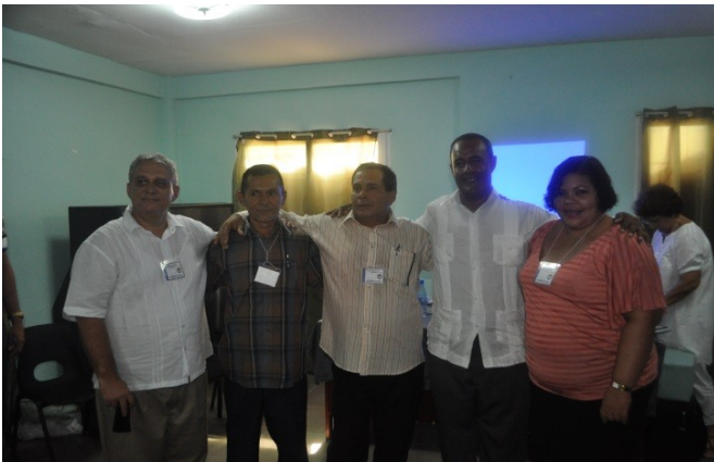
Newly elected Board of the Moravian Church in Cuba.