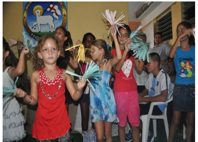
Jaguey Grande children's choir.