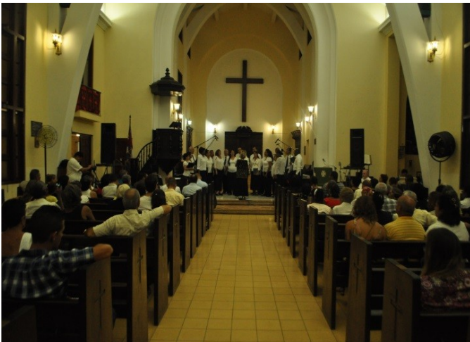
Ordination of 3 Deacons, Consecration of 1 Presbyter, 2 Baptisms and Installation of newly elected Board of the Moravian Church in Cuba at the Episcopal Cathedral in Havana