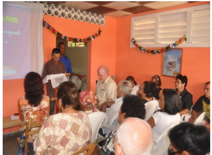
House church in Havana.