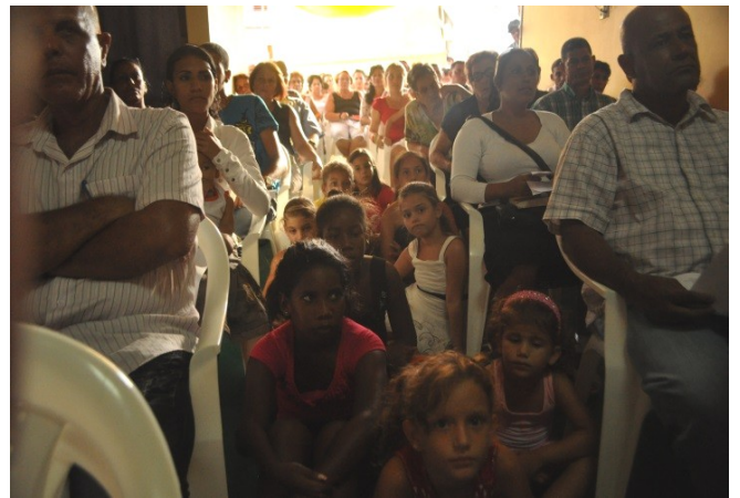
Jaguey Grande, Matanzas, House Church.