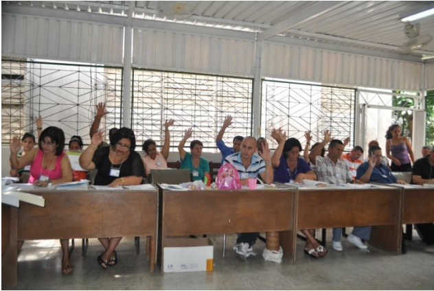
Delegates from 5 Districts voting to approve Book of Order of the Moravian Church in Cuba.