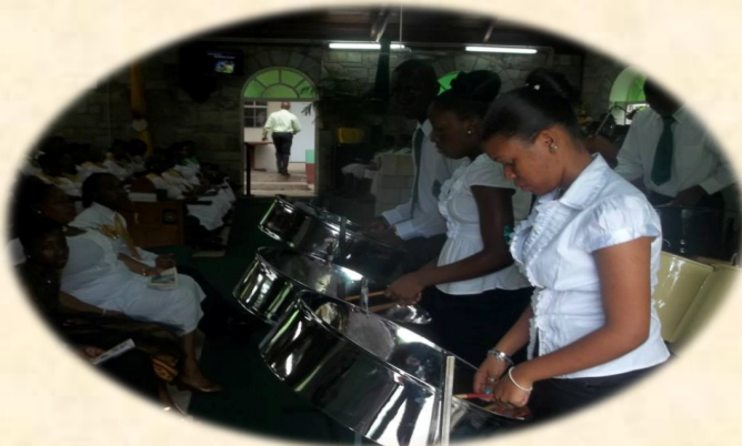
Gracehill Steel Orchestra