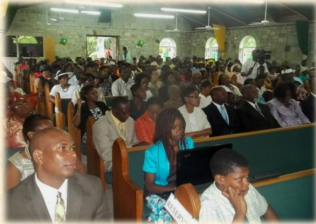
Cross Section of the Congregation at Gracehill Anniversary