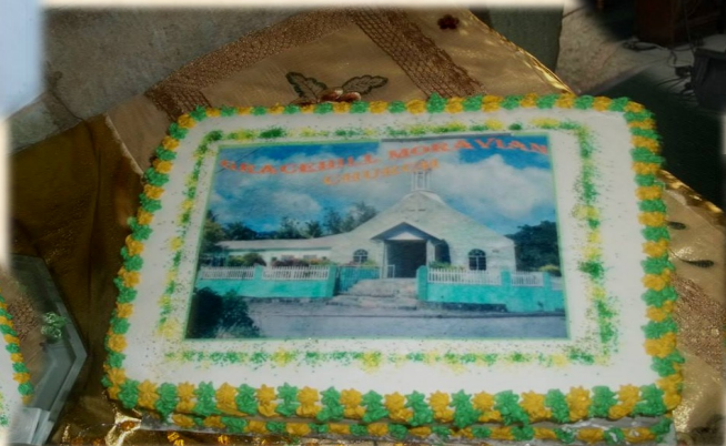
Gracehill Anniversary Cake