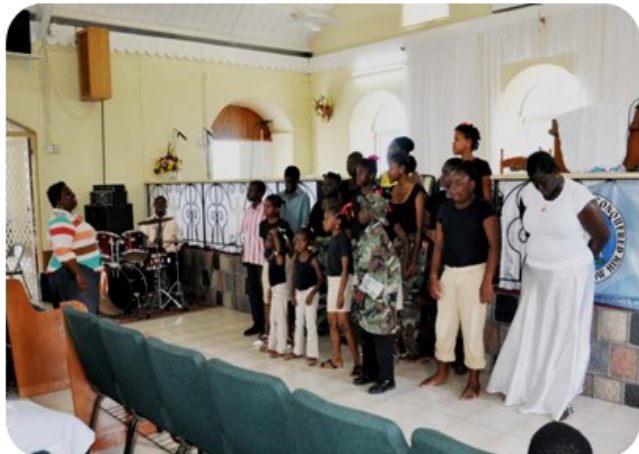
New Dawn Congregation Youth in the Talent Explosion