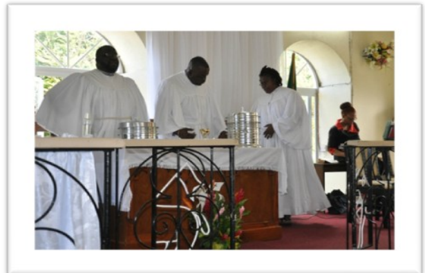
Celebration of the Lord's Supper

Fellowship around the Lord's Table was shared as more hymns such as Love Divine All loves Excelling, Here O My Lord I See Thee Face to Face, and Hark My Soul It Is the Lord were sung.