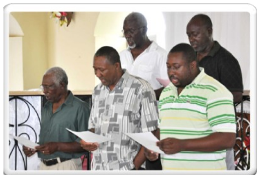
Estridge Brethren in Song