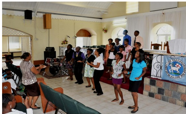
Zion Youth, "I Smile"