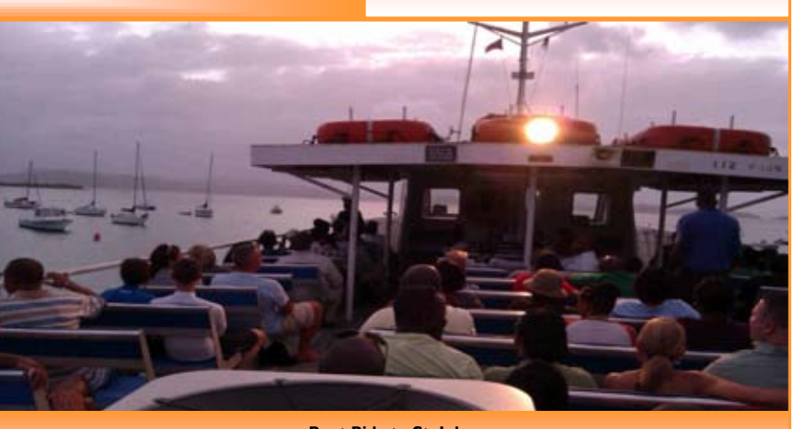
Boat Ride to St. John