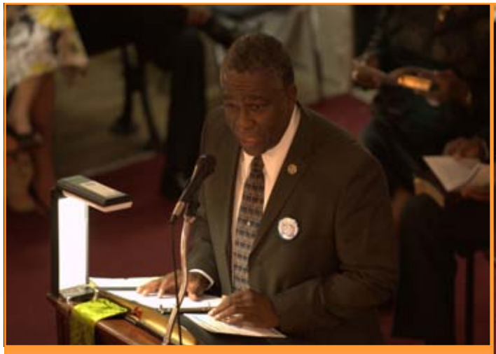
Greetings by the Lieutenant Governor Francis of the Virgin Islands