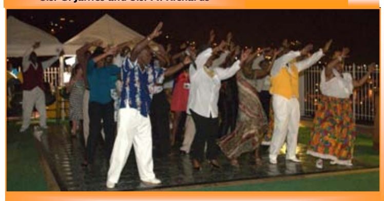
We Exercising, Hands up and Wave