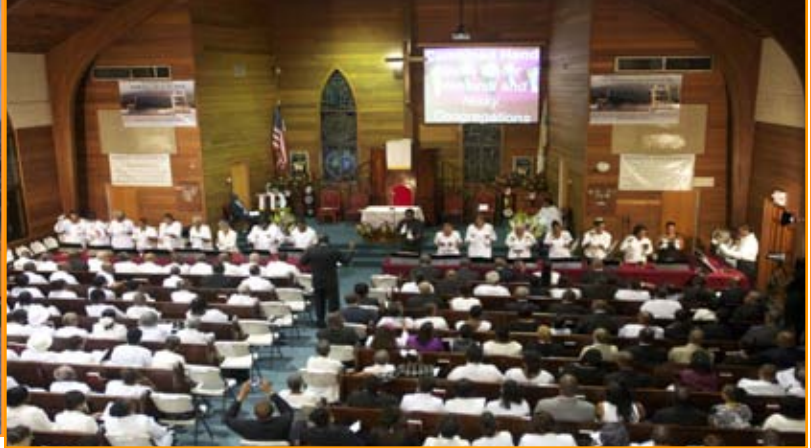
Hand Bells Choir