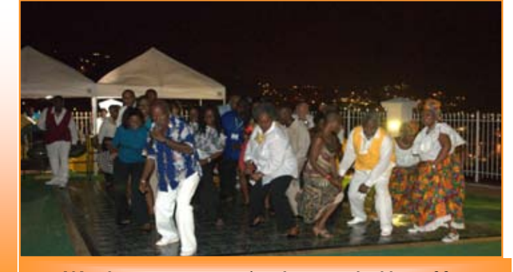
Watch we now, we getting down, we had lots of fun