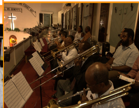
Brass Section of the Synod Choir