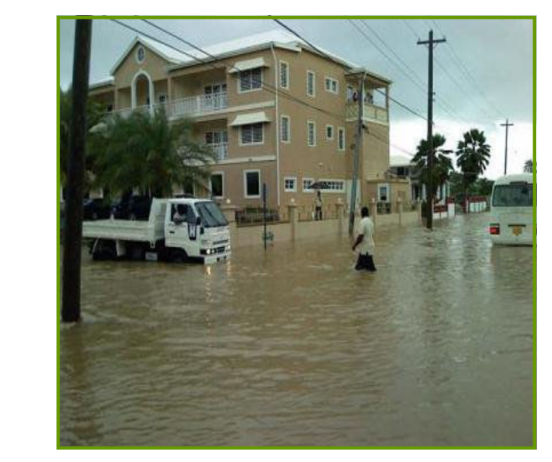
Flooding at different points

Hurricane Earl passed on the North Eastern side of Antigua and Barbuda between the 29th and 30th August, 2010. It dumped 7" of rain on the Island in 16 hours and caused wide spread flooding in the low lying areas. There were many downed power lines, poles, trees, and in several areas there were landslides. Farmers were hardest hit, for many farms were submerged under 3'- 4 feet of water.