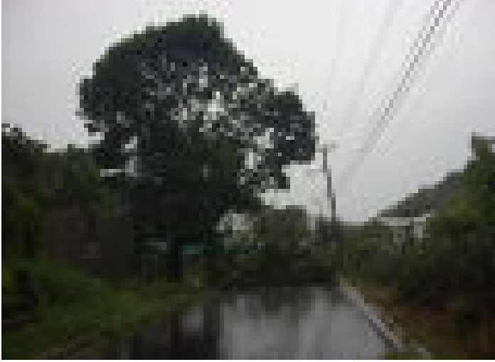
Fallen cable lines

PROVINCIAL THEME 2010: PURSUING THE BLESSING