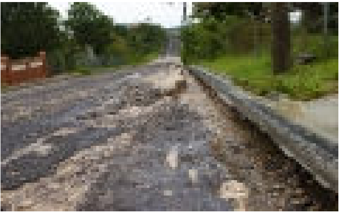
Road eaten by water way