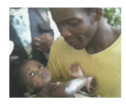
Baby pulled from rubble